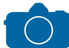
ABB Photo competition 2005

Get your motor running and your camera ready.