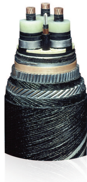
...XLPE cables for AC