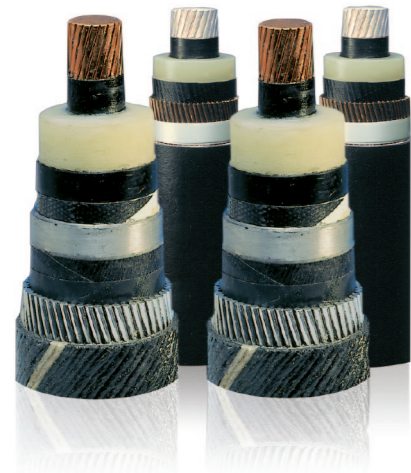
HVDC Light cables for DC or...