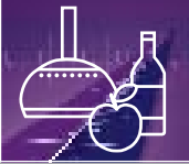
ABB supplies an unparalleled selection of instrumentation equipment and systems for use in all types of food and beverage production processes. Utilizing ABB's innovative products, you can create advanced systems that will help you ensure economical, reliable and safe performance of your plant facilities.