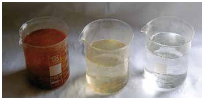
Water before, during and after treatment at off ABB de-oiling plants)