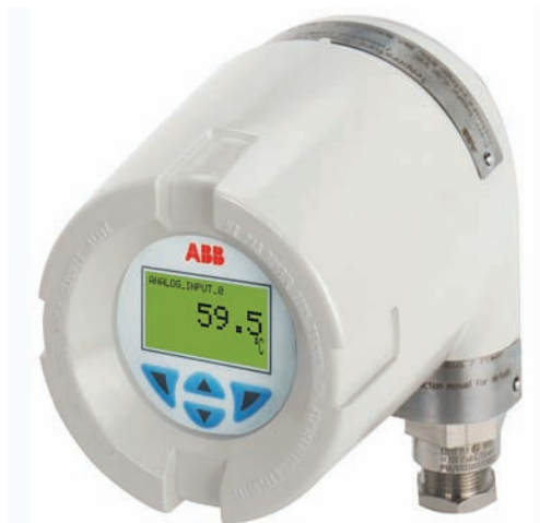
ABB's TF202 field mounted temperature transmitter has a robust design for hazardous areas

The starting point for reliable and accurate instrumentation is choosing the right device for the job. Although this seems an obvious statement there are many instruments installed that are either not up to the task or do not offer the specification to offer real benefits to the business.