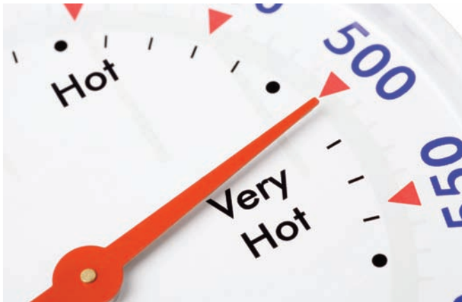
Consider the operating environment when specifying instruments to increase suitability as well as considering appropriate maintenance needs

It is important for any device to be installed and commissioned correctly. This requires not just following the manufacturer's operational specifications, but also considering post installation maintenance requirements. Instruments that are difficult to access are typically ignored or bypassed when performing maintenance activities. Devices should therefore be installed and commissioned to meet the precise design specifications and be easy to access.