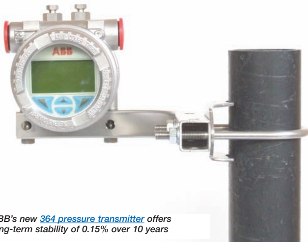
ABB's new 364 pressure transmitter offers long-term stability of 0.15% over 10 years

Cutting corners and avoiding steps in a maintenance routine are common sources of process error and additional costs. Doing the right job at the right time with the right skills is a sure-fire way to avoid higher costs and reduce downtime, whilst extending the life of the instrument and maximising efficiency. Calibration is a good example. Many pressure transmitter vendors claim their products require recalibration only every five years, but the figures quoted are based on a specific set of conditions that may have little to do with conditions on site. In many cases, the user will only know the correct calibration frequency for sure if he calculates it himself.