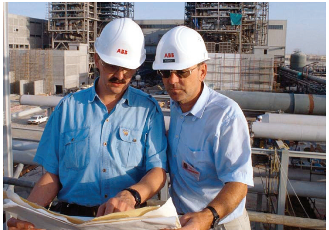
ABB can work with you to formulate and implement the best maintenance plan for your plant

Lifecycle planning meets this need by offering a plan based on manufacturer's research, experience and knowledge overlaid with the skill set and service product. For example, calibration may take place annually to ensure optimum performance, but various wearable components such as fans require replacement before they can introduce measurement or control inefficiencies.