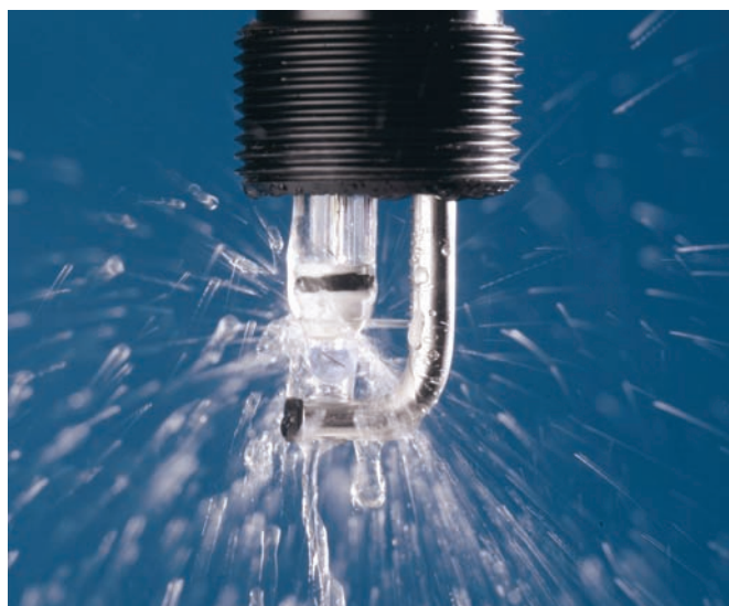
pH meters with a self cleaning function significantly reduce the requirement for manual cleaning

For example, many pH meters benefit from regular cleaning, so in certain circumstances it may be best to install one with an automatic self-cleaning function. This type of sensor uses a jet wash system and would require a change in the maintenance applied.