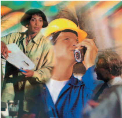
ABB Helps Statoil Set New Records with Europe's First LNG Facility

A competitive multi-scope delivery by ABB that seamlessly integrates Automation and Safety system, Power Distribution Control system, Power Management system, Electrical Equipment, Field instruments, and Analyzers. ABB's Industrial IT systems and equipment put Statoil operators and engineers in complete control of the new energy efficiency benchmark for LNG plants.