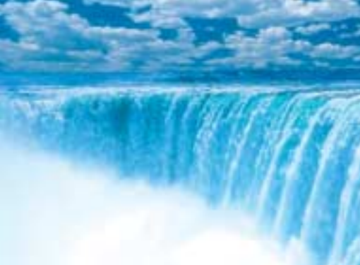
ABB technologies for the complete water life cycle