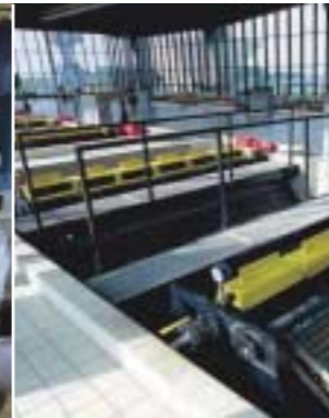
ABB products and solutions are designed to improve performances of water plants and networks. ABB's efficiency motors and variable speed drives can improve energy efficiency by 60%. ABB Water Leakage Management solutions help utilities to monitor and reduce losses of distribution networks. Irrigation solutions help to monitor and optimize the consumption of the water in agricultural applications.